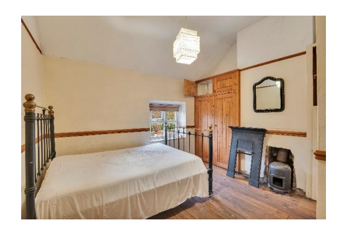
Bedroom 2, a single room, again with pine dado and picture rail. A uPvc window overlooks the rear of the property. Radiator.

Bedroom 1, which is a good double, sits at the front of the property having useful fitted pine wardrobes and built in cupboards to the alcove areas. Pine dado and picture rails. Fireplace with woodburner inset. Upvc double glazed window to the front.