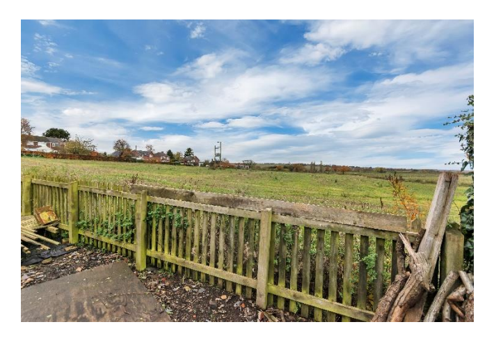
9 New Street Clive has the additional benefit of its own private driveway. The accessway is set alongside the neighbouring property. Double wooden gates provide access to the driveway to the rear garden.